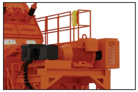
Designed for all-electric power.