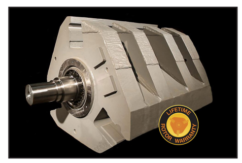
Solid-steel, three-bar, sculptured rotor with LIFETIME ROTOR WARRANTY, North America only.

CC refers to a crushing/screening closed-circuit plant on one chassis.