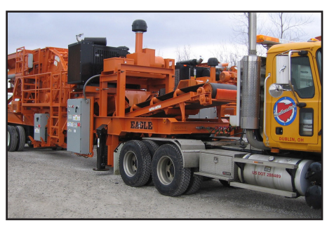
Easy, one-pull transport. Check with your DOT.