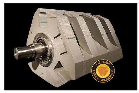
Solid-steel, three-bar, sculptured rotor with LIFETIME ROTOR WARRANTY, North America only.

CV model is featured. The 1200-25 is also available as an open circuit (OC) model.