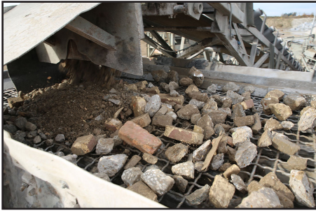
Triple-deck horizontal screen module for screening before crushing.

SS refers to a secondary crushing/screening plant.