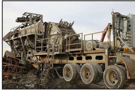
Screen maintenance platforms are available for both sides of screen.