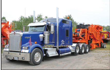
Easy, one-pull transport. Check with your DOT.