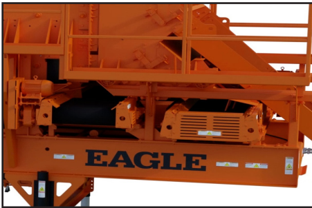
The bottom and middle deck cross conveyors can be mounted to discharge material to either side of the plant.