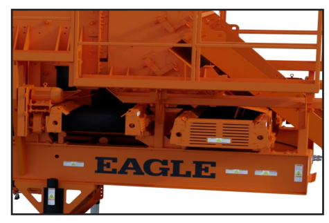
The bottom and middle deck cross conveyors can be mounted to discharge material to either side of the plant.