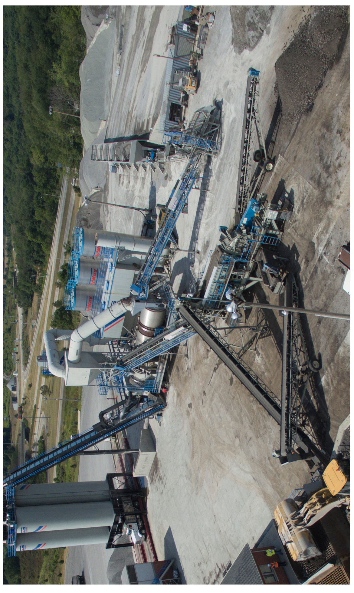
The MaxRap® System is available with a UM-05 impactor and 5' x 16' (1.5M x 4.9M) screen or with a UM-25 impactor and 6' x 20' (1.8M x 6.0M) screen, to meet your specific needs.