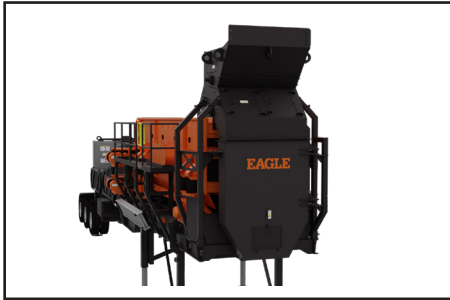
Calibration chute for sampling verifies that the mix-design spec requirement is correct.