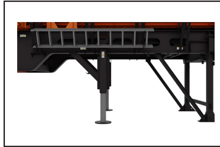
Hydraulic lift and leveling system enables quick set up and tear down by using the hydraulic run-on legs.