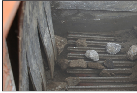
Screen products first before crushing, crush all products or crush with the grizzly product removed.